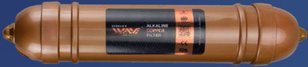
ALKALINE COPPER FILTER