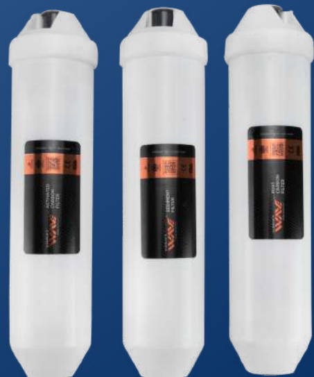
INLINE FILTER QF