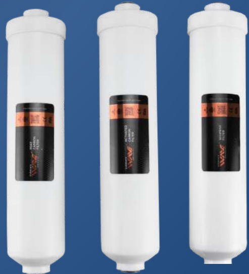
INLINE FILTERS THREAD