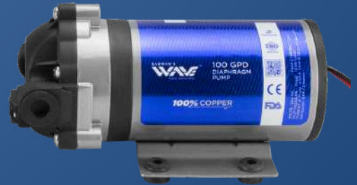
75 GPD PUMP