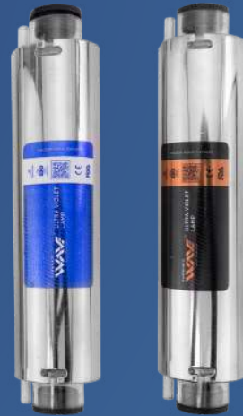
UV BARREL SS