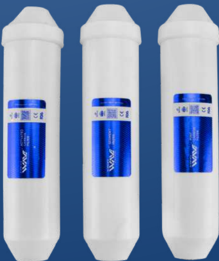
INLINE FILTER QF