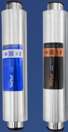
UV BARREL ALUMINIUM