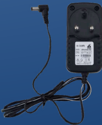
SMPS 24v 2 Amp