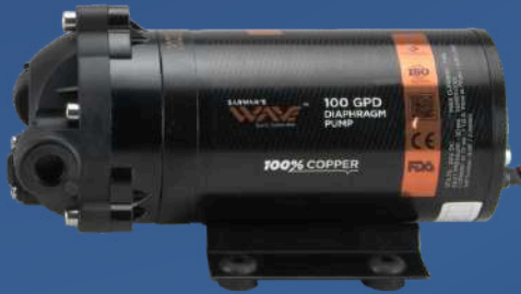
100 GPD PUMP