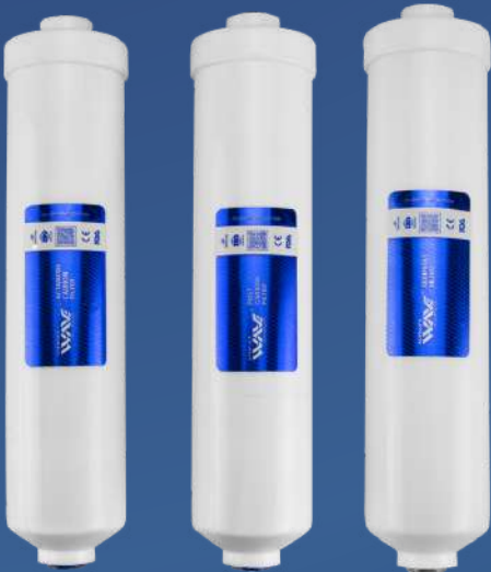
INLINE FILTERS THREAD